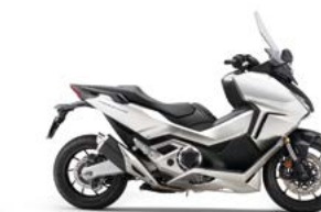
MAT BETA SILVER METALLIC