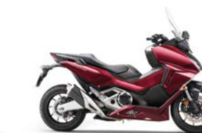
CANDY CHROMOSPHERE RED