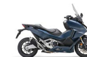
MAT JEANS BLUE METALLIC